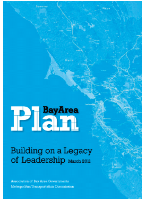
MTC / ABAG